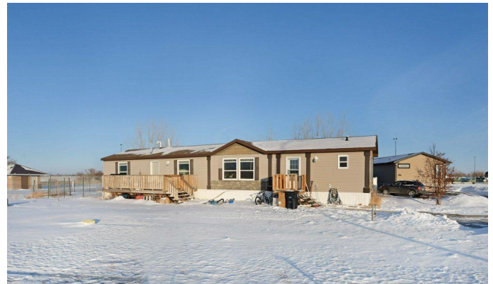
127 Meadowplace Dr E, Brooks, AB

Main Floor Exterior Area 1517.55 sq ft Interior Area 1391.31 sq ft